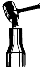
Seat a new bullet